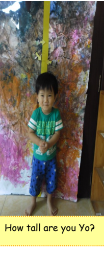
How tall are you Yo?