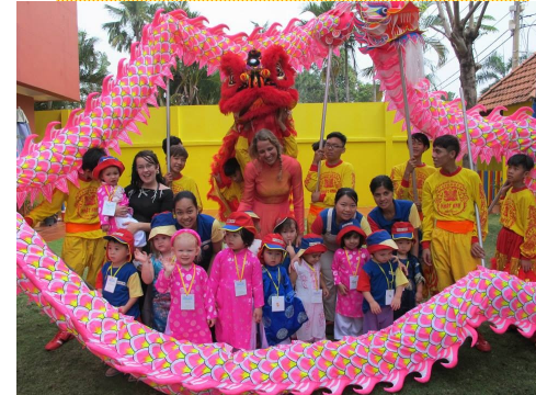
The whole class are big and brave to stand with the Dragon for a class photo!