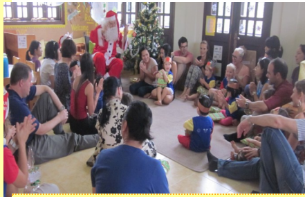
Santa Comes to visit us for our class Christmas party

Over the last few months we've had lots of celebrations; Christmas and Tet and Valentines day! We have also been celebrating ourselves: Who we are and what we can do! This lovely cele-