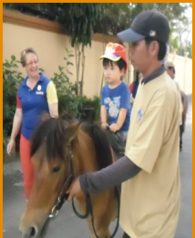
Miu Miu groomed one of the horses.